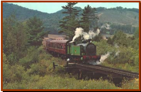
Boyne City Rail Road

Step back in time to an era when horses outnumbered cars as the main form of transportation, logging was the main industry, and every yard had an outhouse!